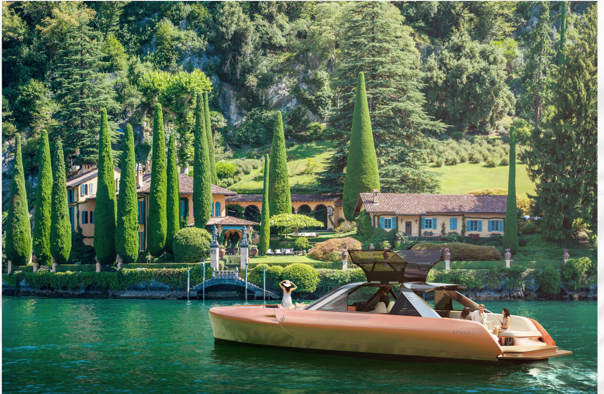
TYPE 48 LIMOUSINE